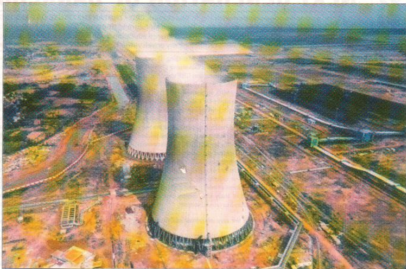
HI-END CICO RANGE OF PRODUCTS WERE USED FOR THE CONSTRUCTION OF SHIHHADRI THERMAL POWER PROJECT-NTPC.

better and durable construction in a clean environment. CICO offers solutions to nearly every conceivable problem in construction. This has been possible with our entire range of world-class products in waterproofing, concrete admixtures, concrete aids, protective coatings and impregnations, grouts, floorings, shotcrete products, epoxy-based repair compounds, sealants, adhesives and capsules for bolting and anchoring. Senior scientists from prestigious R&D institutes have been roped in for ongoing research in the company.